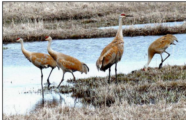
Sandhill Cranes.