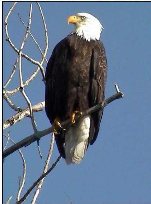
Bald Eagle, adult.

February 24 Dolly Robison reported seeing the Great Egret at Stage Gulch Creek and on March 2 observed