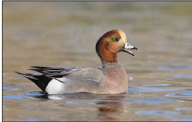
Eurasian Wigeon.

The Eurasian Wigeon is closely related to its counterpart, the American Wigeon. They are both dabbling ducks and about the same size and shape. The male Eurasian Wigeon stands apart, however, with its rusty-red head and gray flanks and grayish back. The females are more difficult to tell from American Wigeon, due to much variation in coloring. The female Eurasian Wigeon usually has a warm-brown to reddish head and flanks. Females, however, can be either reddish in coloration or gray, making it more difficult to distinguish from an American