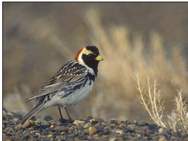
Lapland Longspur.