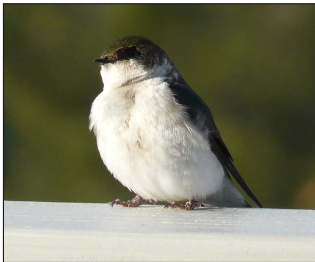
Violet-green Swallow.

March 12, June and Aaron found Echo Meadows full of Sandhill Cranes . June noted that at first it appeared there were two or three bunches of less than fifty cranes. Then for some reason one group flew and