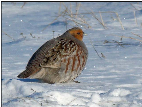
Gray Partridge.