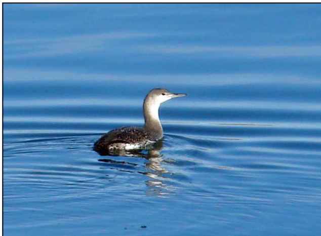
Red-throated Loon.

January and there was less snow than they found in November. Joy's bird sightings included: Red Crossbills, Cassin's Finches, Mountain Chickadees, Pygmy and White-breasted Nuthatches as well as Clark's Nutcrackers and a pair of Common Ravens .