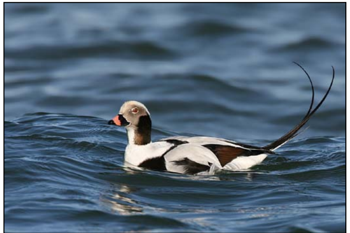
Long-tailed Duck.