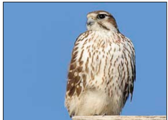
Prairie Falcon at rest.

Both the Prairie and the Peregrine Falcons average about 16 inches in length and weigh just over a pound and a half. They are usually found in different habitats and that may be the first clue in identifying these falcons. The Prairie Falcon is a bird of the