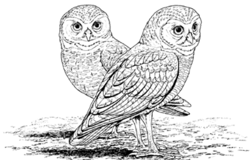
Original art work by John Green Copyright 1989, Dover Press