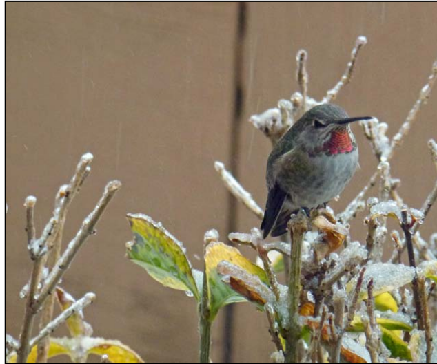
A very cold female Anna's Hummingbird.

Canada Goose, Cackling Goose, Wood Duck, Mallard, Gadwall, Green-winged Teal, Eurasian Wigeon, American Wigeon, Cinnamon Teal, Redhead, Ring-necked Duck, Greater Scaup, Lesser Scaup, Common Goldeneye, Barrow's Goldeneye, Bufflehead, Hooded Merganser, Common Merganser, Red-breasted Merganser, Ruddy Duck, California Quail, Gray Partridge, Chukar, Wild Turkey, Ring-necked Pheasant, Bald Eagle, Northern Harrier, Red-tailed Hawk, Rough-legged Hawk, Golden Eagle, American Kestrel, Merlin, Prairie Falcon, Pied-billed Grebe, Western Grebe, Horned Grebe, Great Blue Heron, Black-crowned Night-Heron, American White Pelican, Double-crested Cormorant, Virginia Rail, American Coot, Ring-billed Gull, Rock Pigeon, Mourning Dove, Eurasian Collared-Dove, Barn Owl, Great Horned Owl, Western Screech-Owl, Short-eared Owl, Anna's Hummingbird, Belted Kingfisher, Northern Flicker, Downy Woodpecker, Pileated Woodpecker, Northern Shrike, Black-billed Magpie, Western Scrub-Jay, American Crow, Common Raven, Black-capped Chickadee, Mountain Chickadee, Red-breasted Nuthatch, White-breasted Nuthatch, Pacific (Winter) Wren, Marsh Wren, Ruby-crowned Kinglet, Hermit Thrush, American Robin, Cedar Waxwing, European Starling, Yellow-rumped Warbler, Spotted Towhee, Song Sparrow, Fox Sparrow, White-crowned Sparrow, Golden-crowned Sparrow, Dark-eyed Junco, Red-winged Blackbird, Western Meadowlark, Brewer's Blackbird, Yellow-headed