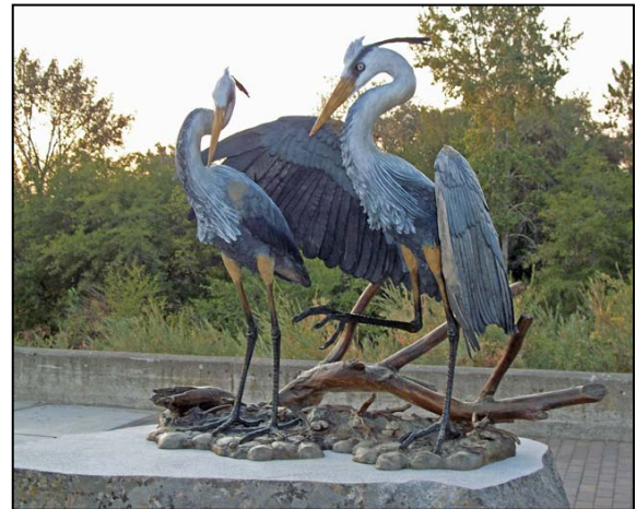
Great Blue Heron sculpture on the River Walk at the new park.

had been installed at the site to commemorate the statue, the sculptor, and the primary people and organizations responsible for acquiring the statue for the citizens of Pendleton. The plaque lists five organizations that contributed to the establishment of the statue and pedestal, including: Pendleton Foundation Trust, The