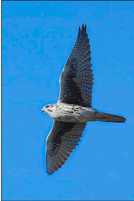
Prairie Falcon showing black "wingpits," an identifying characteristic.

The Prairie Falcon eats mostly small mammals and some birds caught in flight. It usually hunts by flying fast and low, often only a meter or so from the ground, hoping to surprise its prey. Its cruising speed is about 45 mph, and it can accelerate in a chase. It also pursues prey from a perch, usually catching birds in a level flight.