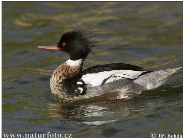
Red-breasted Merganser.