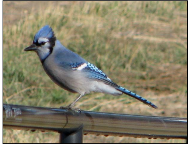
Blue Jay.