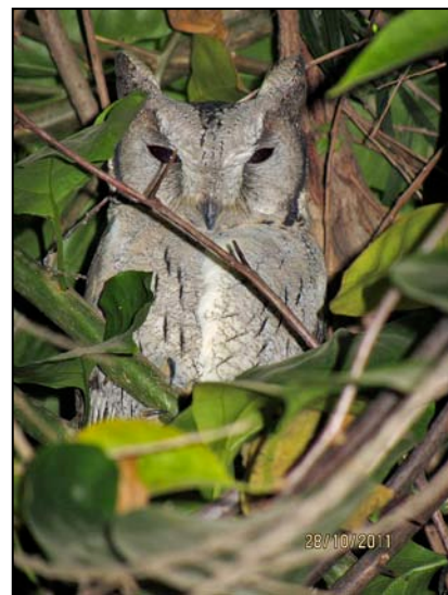
Collared Scops Owl

As all of those people stood there in their little open Gypsy, totally exposed (no top, no roof, no window – no nothing) when suddenly that huge tiger burst out of the brush with an enormous roar, charged the vehicle to about 4-5 feet, looked at the people straight in the eye and again gave a great roar (a very, very impressive sound from a 500 pound, 10ft. long cat), then turned, leapt into the brush, and disappeared.