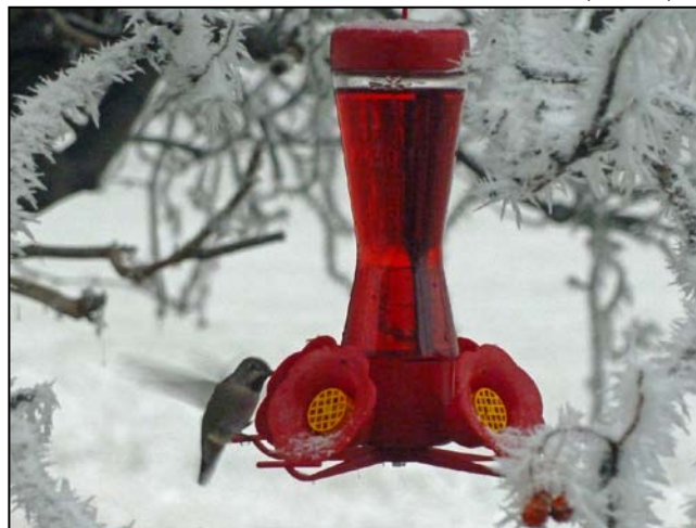
Female Anna's Hummingbird, Milton-Freewater.