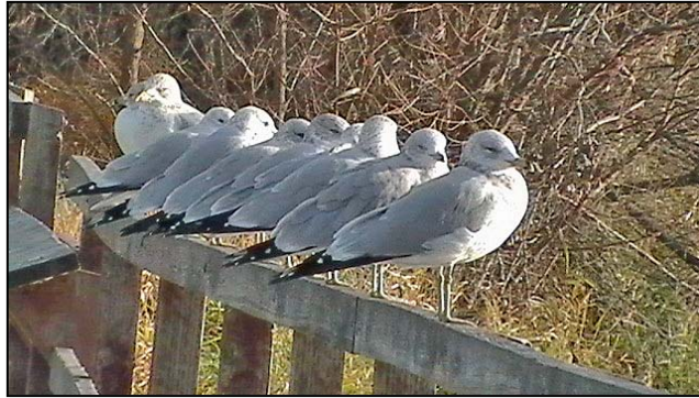
Ring-billed Gulls.