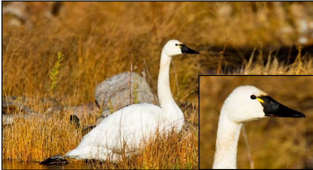
Tundra Swan. Note yellow lores on the inset photo.