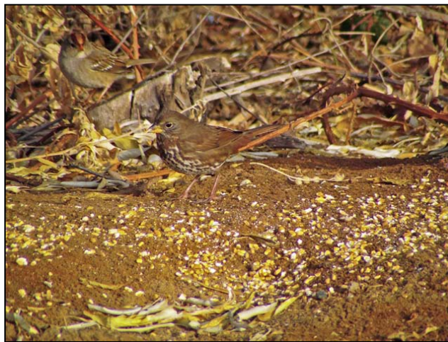
Fox Sparrow.