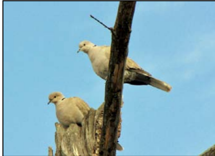
Eurasian Collared-Doves.

I'VE LONG BEEN A BIRDWATCHER. I was the president of the Grande Ronde Bird Club in La Grande for many years and my property lies on the south border of Ladd Marsh (my east fence borders Exit 268 on I-84). I see a lot of critters out here – especially migrating birds as I'm directly south of the big Ladd Marsh ponds. Recently, huge skeins of tundra swans (300+) have been flying overhead at tree level the last several days – truly awesome.