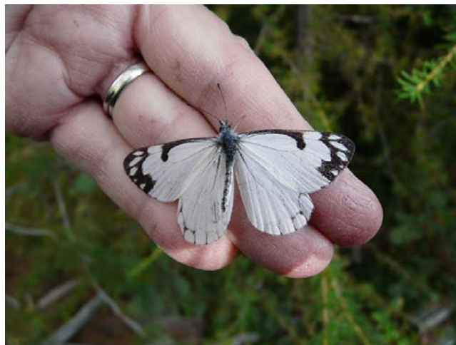
Pine White butterfly.

For unknown reasons, the population erupts in certain years resulting in millions on the wing to flicker