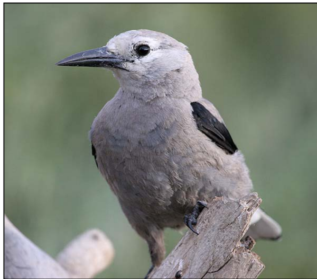
Clark's Nutcracker.

birds and small mammals get into the seed caches, but the Nutcrackers are known to store up to 33,000 seeds per bird in as many as 2,500 caches of 5-10 seeds each. This may take in an area of over 12 miles.