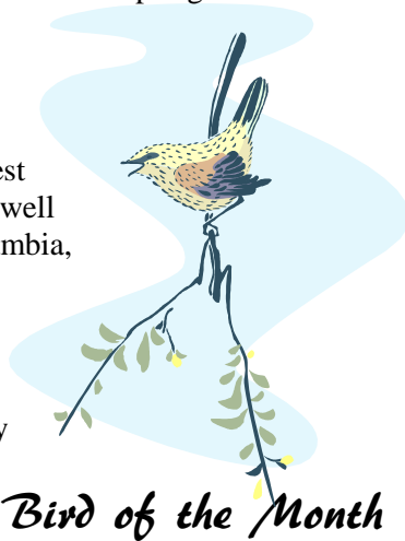
Bird of the Month

Being in the Corvid family, along with such cousins as jays, crows, and ravens, Clark's Nutcracker is known for its intelligence. Nutcrackers have a sublingual (underneath the tongue) pouch capable of holding about 90 pine seeds. This pouch greatly enhances the bird's ability to transport and store seeds. The surplus pine seeds are stored, usually in the ground, for later consumption when food is scarce. They regularly store more seeds than they consume and are keepers of the forest in the sense that they reseed their own pine trees. Of course, some other