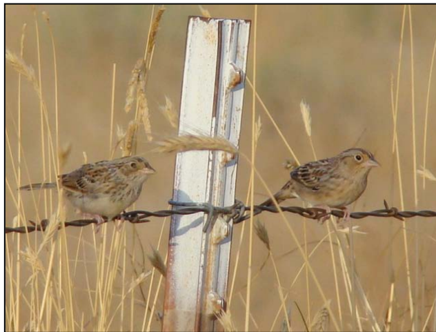
Grasshopper Sparrow (juvenile left; adult right).

Gurdane Road looking for Sage Sparrows . He had no luck find a Sage Sparrow but found many other interesting birds that included Lark Sparrows , Chipping Sparrows , a Loggerhead Shrike , one Sage Thrasher and many Vesper and a few Savannah Sparrows . There were also a couple of dozen Say's Phoebes scattered along his route.