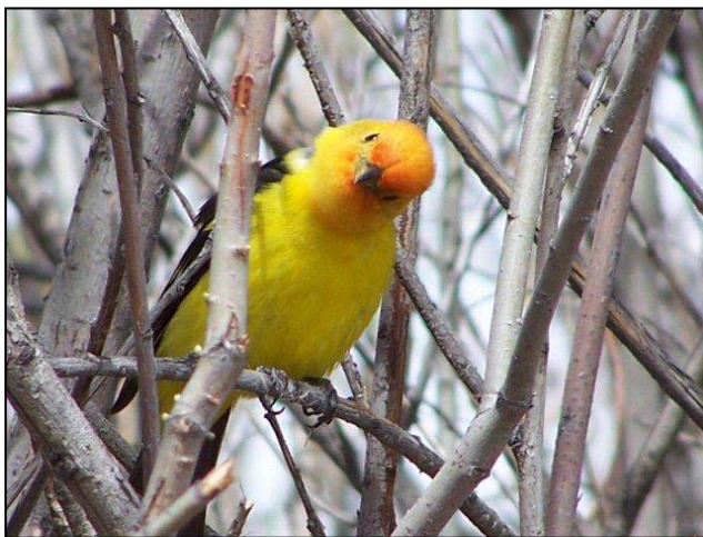
Western Tanager.

September 2, Aaron again checked for Sage Sparrow along the roads west of Pilot Rock. He did not find a Sage Sparrow but did find 2 Loggerhead Shrikes , 2 Sage Thrashers , 3 Lark Sparrows , 30-40 Vesper Sparrows and a few Savannah Sparrows . The grove of white poplar trees along the Gurdane Road yielded American Robins , a couple Western Tanagers , an Orange-crowned Warbler , a Hammond's and a Western Flycatcher . He also noted there were still quite a few migrating Say's Phoebes scattered along the route.