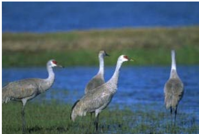
Sandhill Cranes.

Leaving Indian Lake about 12:30 on August 30, Aaron and Craig Kvern saw an adult (blue-gray back) Northern Goshawk flying across the road and through the forest just above eye-level.