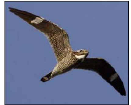
Common Nighthawk.

years old, and we lived up on Pendleton's North Hill near the top of NW 7th. I was pretty fascinated by the way the Nighthawks flew, very maneuverable, and I liked the sound they made when they dived.