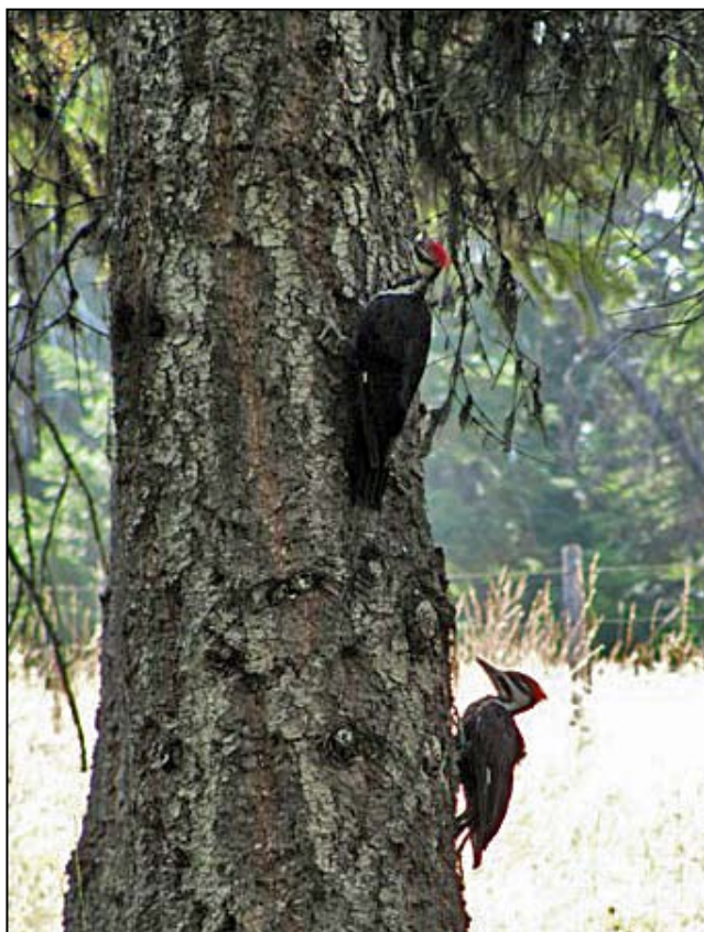
Pileated Woodpeckers.

In late August, Joy Jaeger reported a flock of at least 22 Mourning Doves around her and husband Steve's mountain cabin above Albee. There were 6 Steller's Jays eating the sunflower seed she put out around the cabin and she saw 3 Pileated Woodpeckers in one group. She has also been seeing Dusky Grouse around the cabin including one group of five.