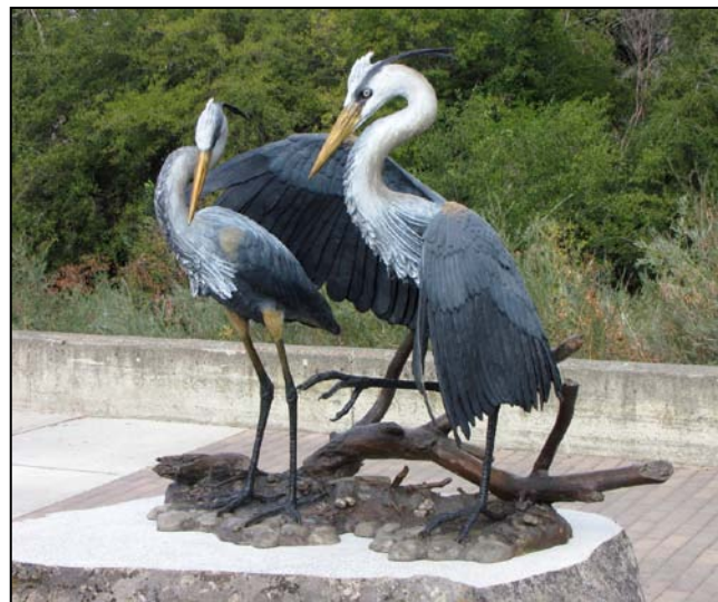
Bronze sculpture by Michael Maiden.

sculpture was selected based on the authenticity of the anatomy and posture of the birds. The courting herons represent the wildlife inhabiting the Umatilla River area along the River Parkway. A