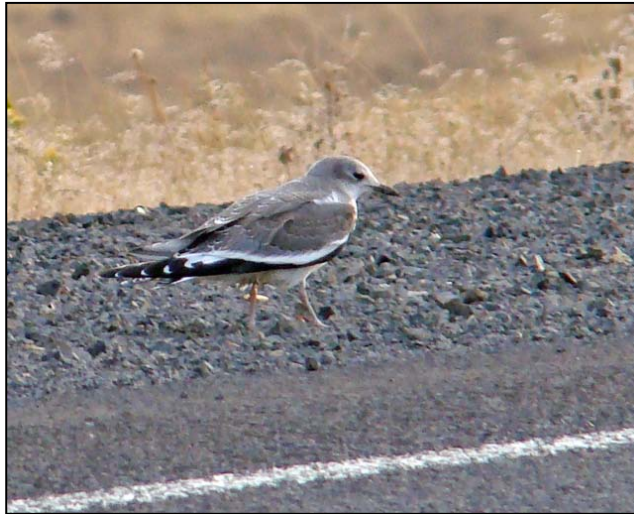
Sabine's Gull (juv.).

An astonishing find was a juvenile SABINE'S GULL , observed and photographed by Aaron and Diana LaSarge on September 15, while it foraged along the shoulder of Hwy 395 at "Cape Horn," which is located about 2 miles north of Battle Mountain Forest Scenic Corridor. Sabine's Gulls are rare, periodic fall migrants in Umatilla County, and are always seen near large bodies of water, especially McKay Reservoir, Cold Springs Reservoir, and the Columbia River. Why one would be foraging along the roadside in the dry grass-land habitats in the foothills of the Blue Mountains is anyone's guess.