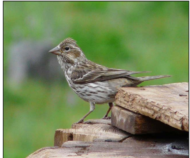
Cassin's Finch (female).

September 4, June and Aaron birded in the NW portion of the county. At Cold Springs NWR, June reported not much going on, but they did see 5