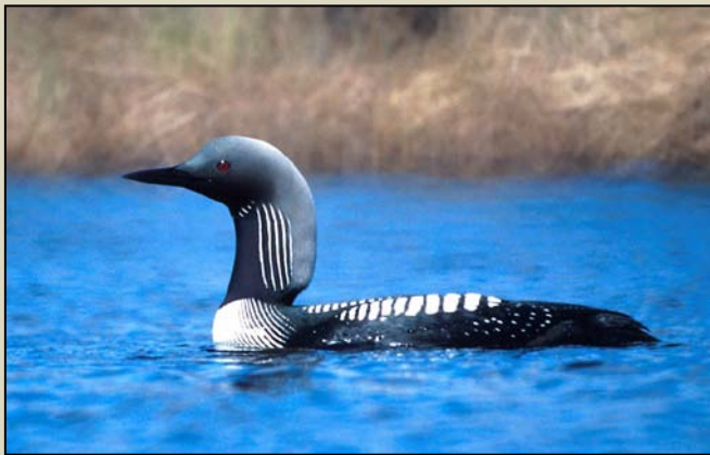
Pacific Loon.

Pacific Loons breed on fresh water tundra lakes. The nest is often just a depression in the grass where 1 or 2 eggs of variable shades of brown and olive green are laid. The chicks are downy and active, leaving the nest, which is adjacent to water, within a day or two. After spending about 3 months in the Arctic tundra, the Pacific Loons migrate southward and spend most of the other 9 months on the Pacific Ocean. Like other loons, the Pacific Loon is very awkward and walks poorly on land mostly due to the placement of their legs far back of the abdomen. They spend most of their lives in the water where they dive for fish, tracking their prey visually, and